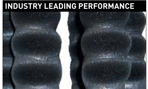
Contamination attached to the 9,000 Gauss magnetic cores